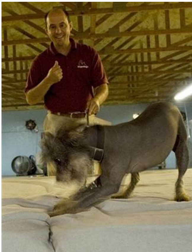
Figure 5. A bed bug-detecting canine indicating on a mattress that bed bugs are present.

can also locate early infestations, even as few as one adult bed bug, leading to cheaper and more successful control.