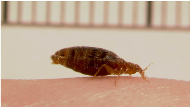
Figure 2. Engorged adult.