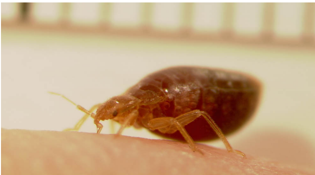
Figure 3. Feeding adult.

1/25" long and are slightly curved. They are usually deposited in clusters and fastened to cracks and crevices or rough surfaces near adult harborages with a sticky cement-type substance.