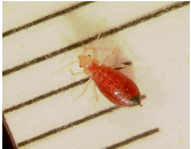
Figure 4. Engorged nymph.

after getting a blood meal (Figure 4 ). There are 5 nymphal stages for bed bugs to reach maturity, which usually take 35-48 days. Adult bed bugs can survive for 6-7 months without a blood meal and have been known to live in abandoned houses for 1 year. In some cases they survive without humans by attacking birds and rodents.