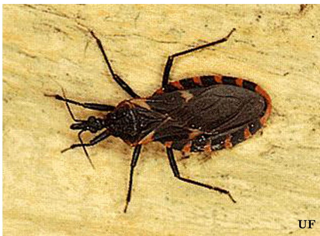
Figure 7. Blood-sucking conenose.

The blood-sucking conenose (Figure 5), or “kissing bug”, primarily feeds at night on the blood of sleeping people or animals, such as raccoons and opossums that burrow in the vicinity. Most bites from conenose bugs are rarely felt, however, some can be quite painful. Infection can occur if the bite wounds are scratched. It is a potential vector of Trypanosoma cruzi , which causes Chagas disease in Latin American countries.