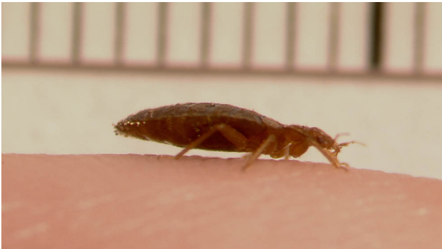
Figure 1. Adult.